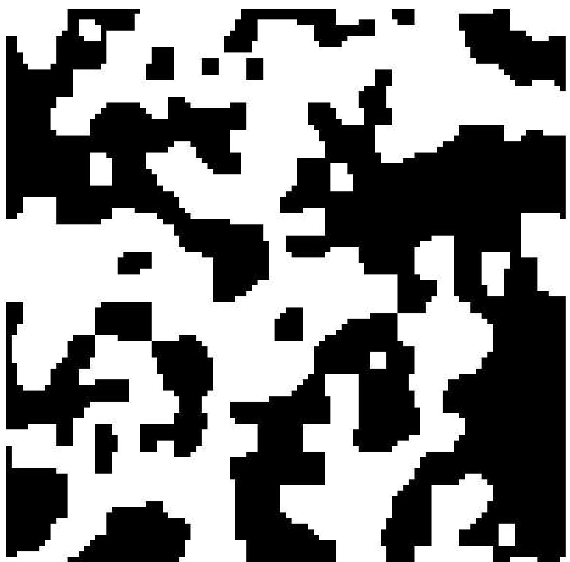
Figure 1: Spatial Sender-Receiver